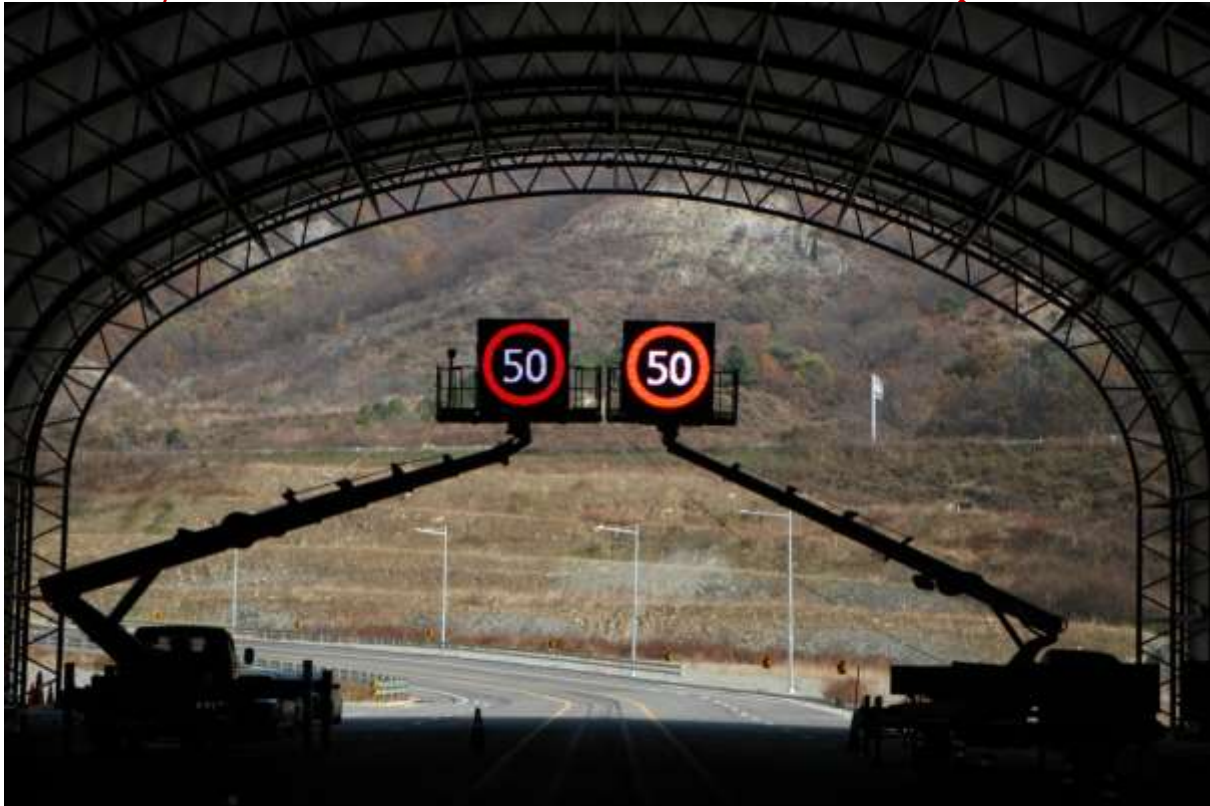
Fig 4. Comparison between conventional VSLs(L) and developed VSLs(R) at normal weather