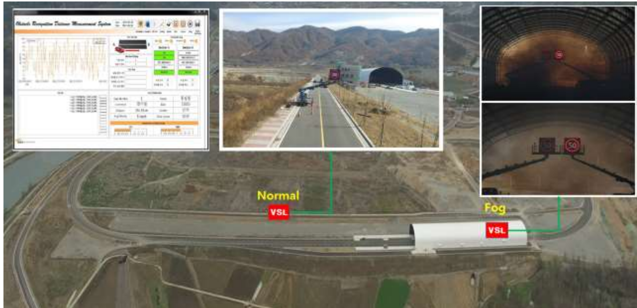
Fig 2. Layout of off-road test

In this study, improved performance of VSLs at normal weather and foggy condition was evaluated in a way of comparing the legibility distance of the driver. The test was conducted at KICT's SOC Yeoncheon R&D center on test bed and tunnel shield. The foggy weather was simulated over a 200m-long tunnel shield and the overall layout is as Fig 2 below.