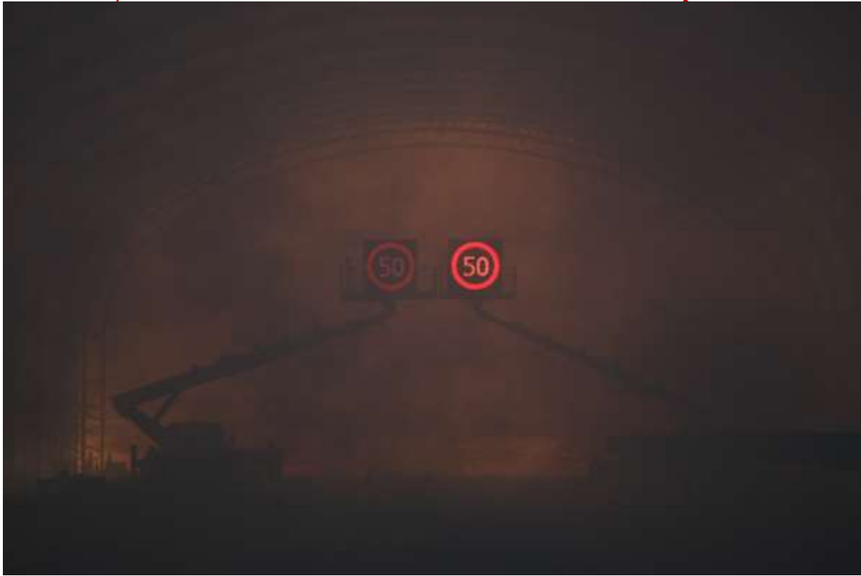
Fig 5. Comparison between conventional VSLs(L) and developed VSLs(R) at foggy condition